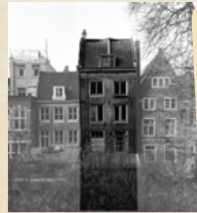
The Secret Annex

Anne brings her diary, which she receives for her thirteenth birthday, to the hiding place.